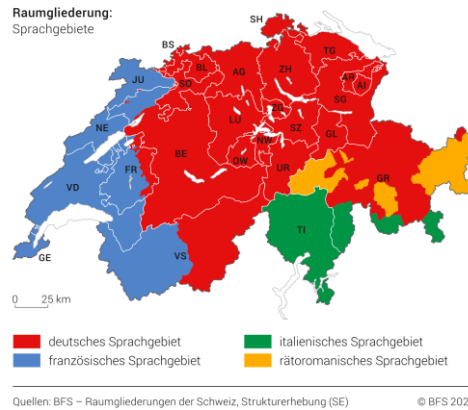
Die vier Sprachgebiete der Schweiz